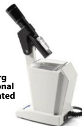
Goldberg w/Optional Illuminated Stand