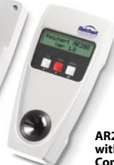
AR200/TS METER-D with Optional Communications Cradle