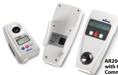
AR200/TS METER-D with Optional Communications Cradle